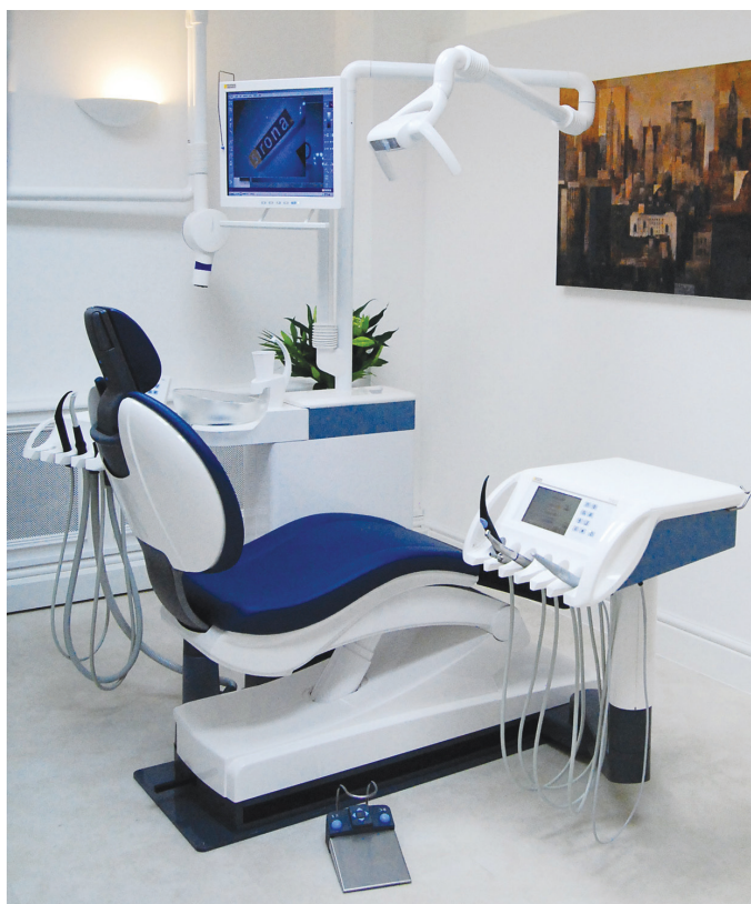
The Sirona Teneo treatment centre

Whether starting from scratch or giving an existing practice a makeover, the entire 'surgery design' process, from choosing the right equipment to a complete installation, can be time consuming, taxing and tiring. But it isn't just the dentist's feelings that need to be taken into consideration, the patients' needs should be foremost.