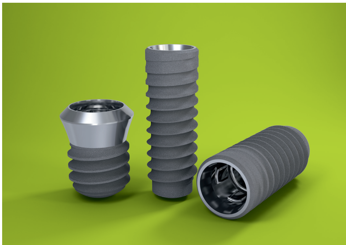
The Roxolid implant portfolio comprises all Straumann implant lines, diameters and lengths

Yes, and they are very excited. I will soon be holding Straumann led implant courses and training at my new facility in Essex.