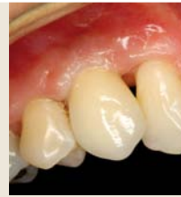
Final Crown fit