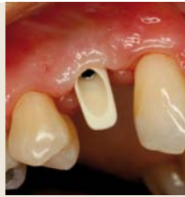
Soft issue healing and abutment fit