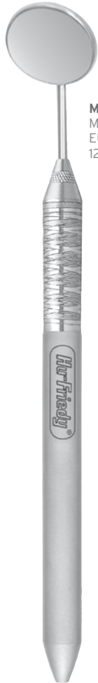
M5C Mirror #5, EU-Thread, 12 pcs/pack