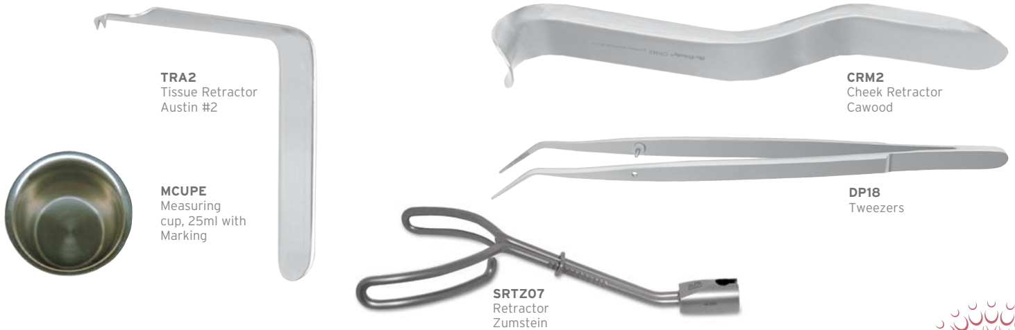
TRA2 Tissue Retractor Austin #2

Light, easy to handle instruments greatly aid the fiddly placement of bone grafts and membranes