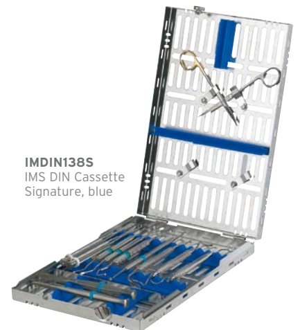
IMDIN138S IMS DIN Cassette Signature, blue