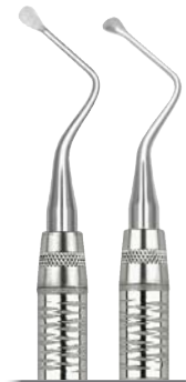
CL876 Surgical Curette Lucas, Handle #6, 3,5mm