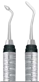
PFIBEQ17 Plastic Filling Instrument Quetin