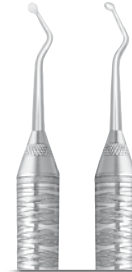
EXC125/66 Excavator, Handle #6