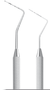
PCPQOW11.5 Probe Quilix