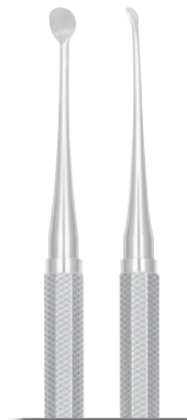
CM2/4 Surgical Curette Molt, Handle #522